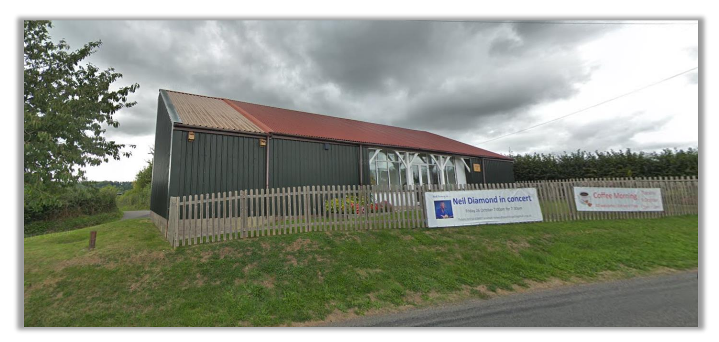
Gwehelog Village Hall, NP15 1RB

To the riders and their families joining us for the first of two trips to Usk this season, thank you for your support and we hope you enjoy your time with us on Sunday. The R25/7 is a bit of a fixture in the VCC calendar and, if you've ridden with us previously, please note that we're using a different location for our HQ this time. There's no car parking available at our usual base so we've moved to the Gwehelog Village Hall on Monmouth Road, which is the road leading away from Usk town centre and eventually terminating at the Raglan roundabout. I believe it's known locally as the "old Raglan Road".