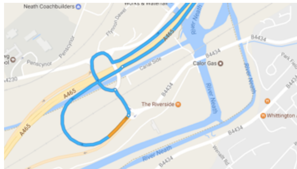
R25/3H Course layout https://www.strava.com/segments/11777401