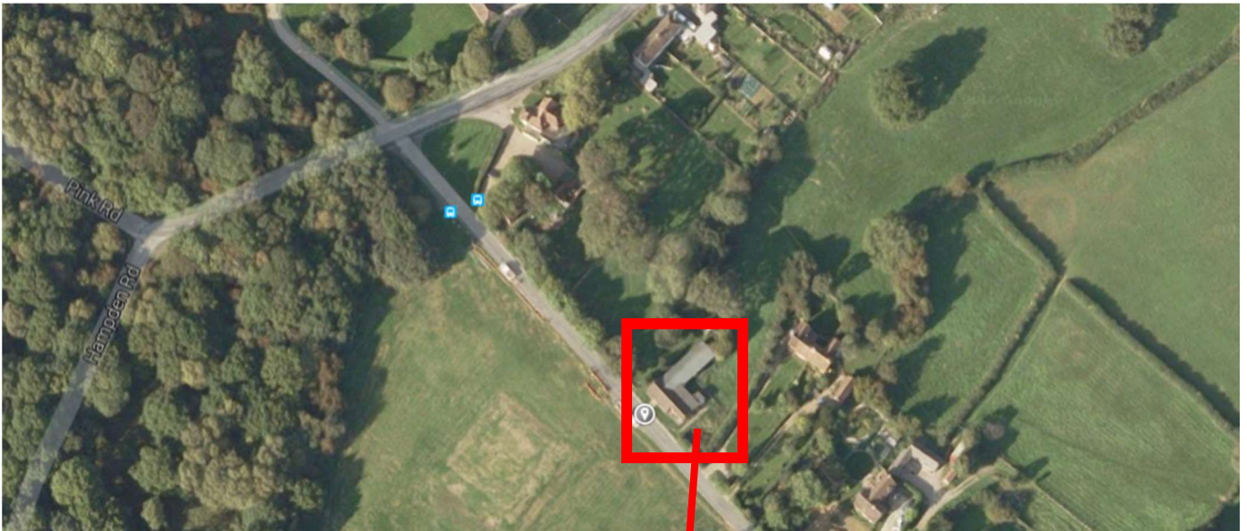
HQ to Start Map