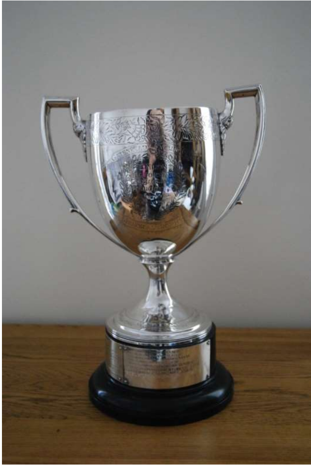
n&dca 100 mile championship gateshead cycling club memorial trophy