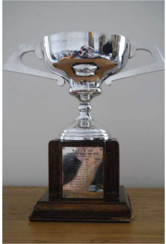
n&dca fastest vet on standard in 100 mile tt jack adams memorial trophy