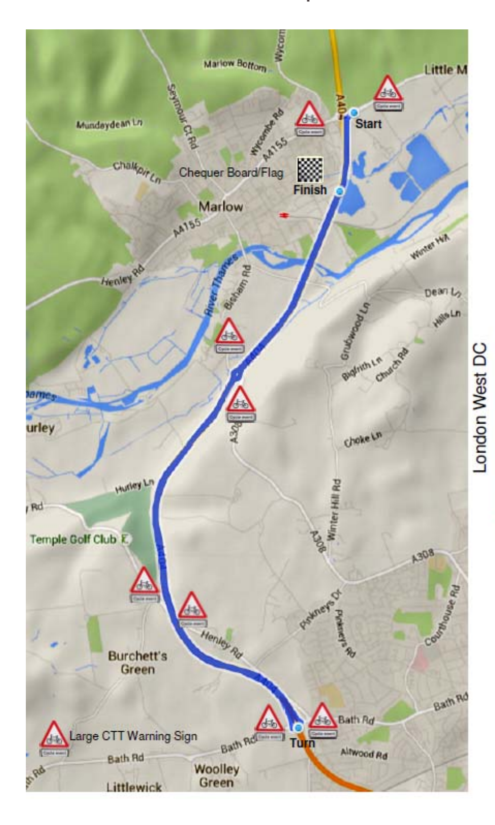
Mandatory sign requirements for ALL CTT events held on H10/22 Marlow