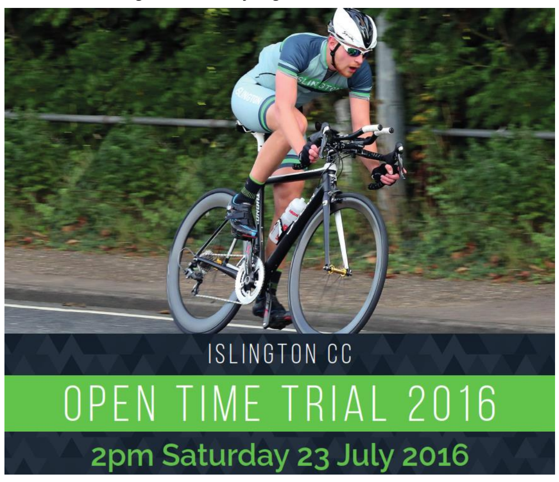
Islington CC wishes you good luck and a safe ride.

Juniors: The minimum age for competitors is 12 years. In accordance with Regulation 15 all junior competitors must wear protective hard shell helmets. Riders under 18 years must know the law and the Highway Code, and be competent to ride on public roads alone. A CTT permission form must be returned to the event HQ.