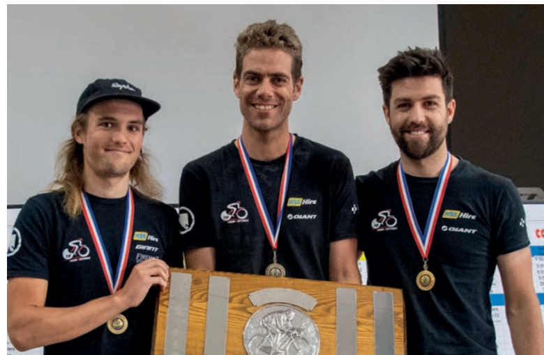
National 50 Miles Team Championship Presentation