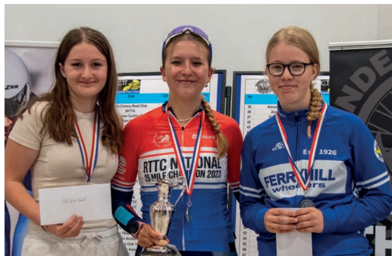
National 25 Miles Junior Girl Winners