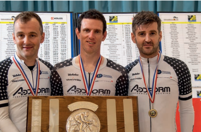
National 100 Miles Men's Team Championship Presentation