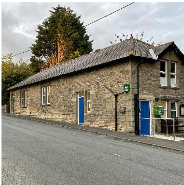
Catton Village Hall

Please ensure that numbers are returned after the event and remember to sign off, otherwise your time won't be recorded in the official results.