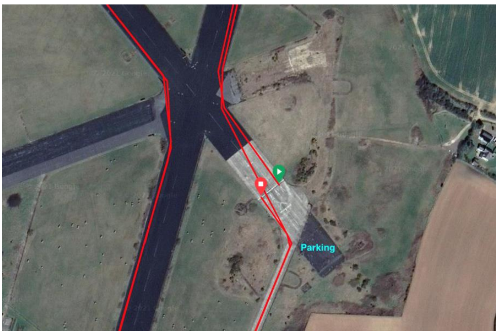
Close up of start/finish, with event parking. No driving anywhere else on the airfield is allowed.